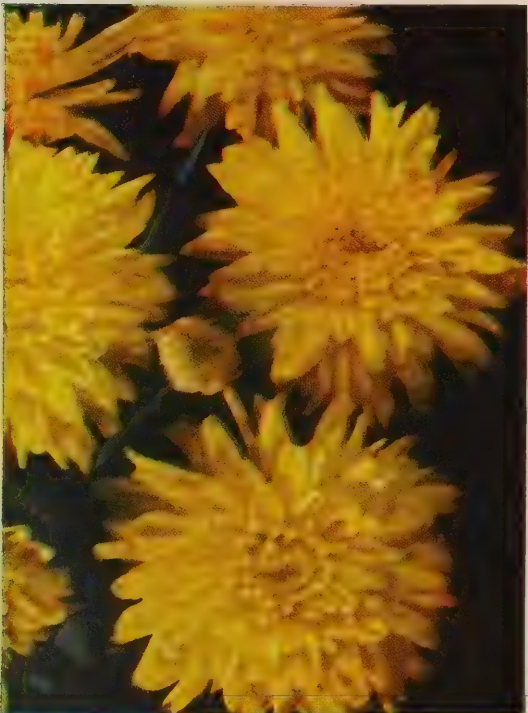
CHARLES NYE. 60c each; 3 for $1.50